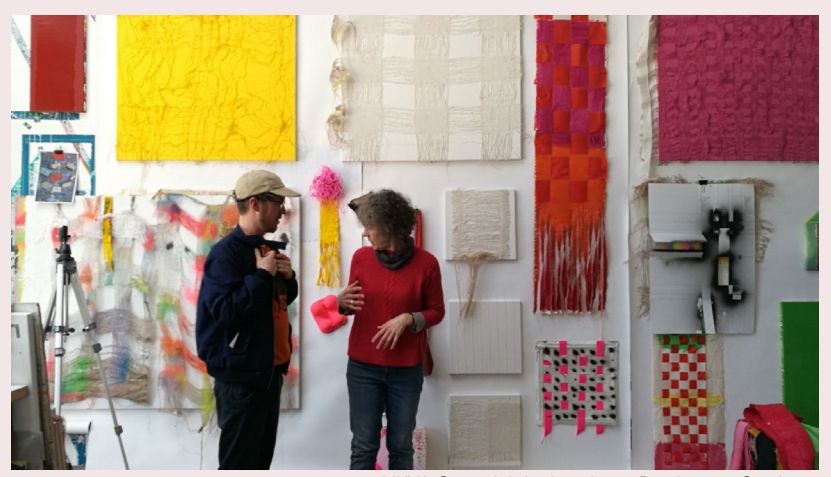
UKYA Cornish Weekender at Porthmeor Studios

Our Creative Development platforms further support the UKYA artist journey, offering peer to peer support and learning. These platforms range from talks to workshops to symposia; delivered with national partners in the cultural and Higher Education sectors across the UK. These are both actual and virtual and support the development of ideas without constraints.