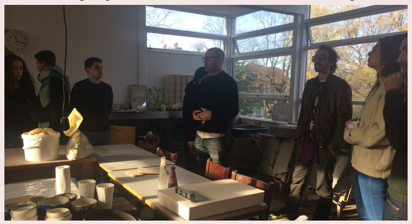
UKYA's 'Work in Common' residency at Primary, Nottingham