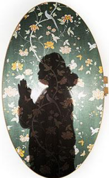
© Letitia Huckaby, Barbara 2020, pigment print on fabric . with embroidery, 70 x 40 x 2 inches

Fall 2020 Artist in Residence at ArtPace.