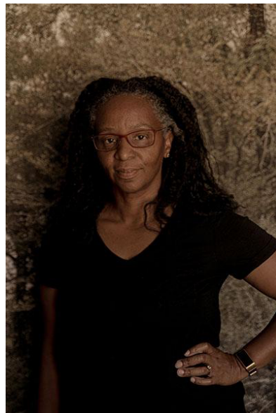
Letitia Huckaby © Rambo